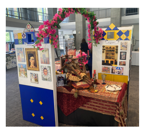
Barbie Rosie the Riveter Frida Kahlo