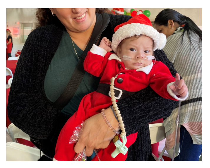
The youngest party attendee dressed up as Santa Claus