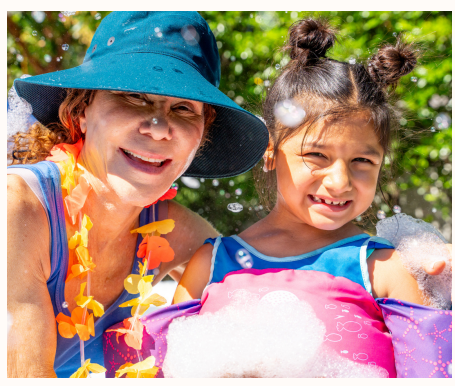
Jill Stein having fun in the foam with a young burn survivor