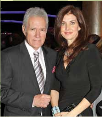
Alex & Jean Trebek