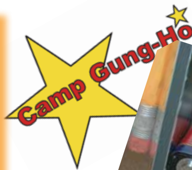
Kidspace Camper exploring Exhibits