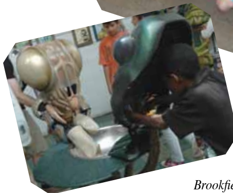
Brookfield Farms Campers