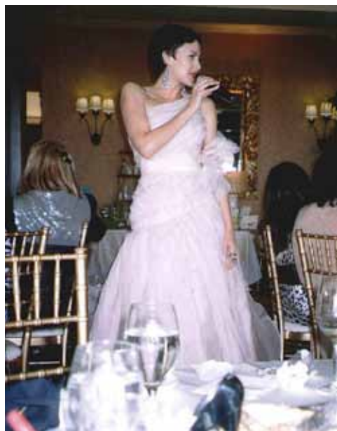
Model wearing Randolph Duke