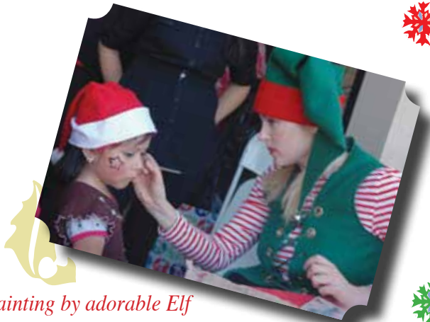
Facepainting by adorable Elf