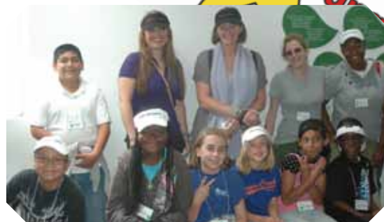
Council Members with Campers at Kidspace